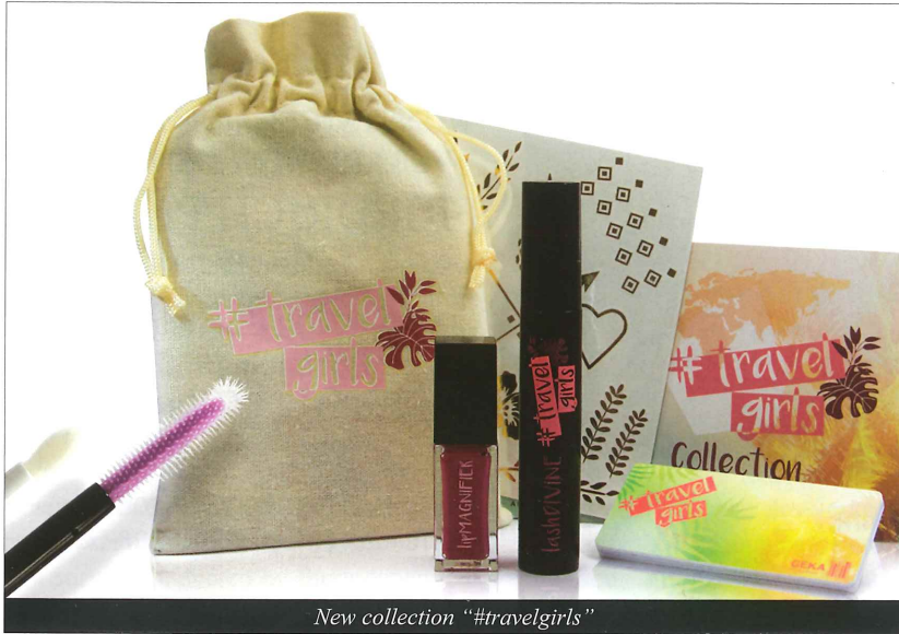
New collection “#travelgirls”